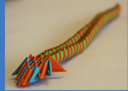
ATSHILAHO GR.8 ENTRY