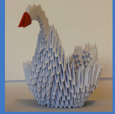
ANESU GR.9 ENTRY