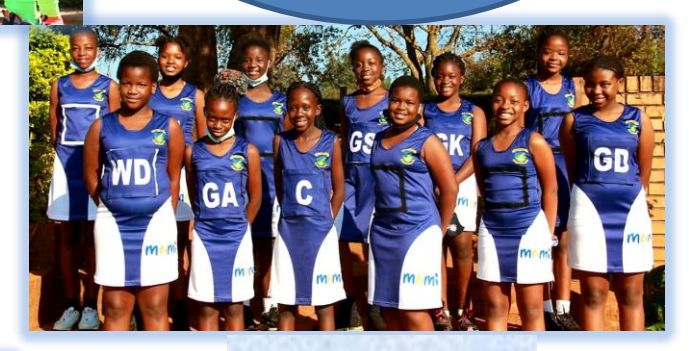
1<sup>ST</sup> TEAM NETBALL